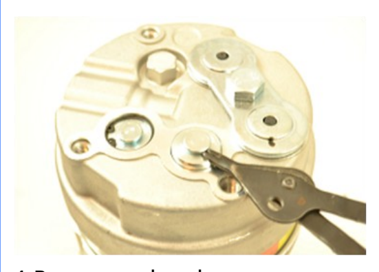
4. Pry up on the plug to remove.

(Caution! Snap ring may fly off due to tension.)